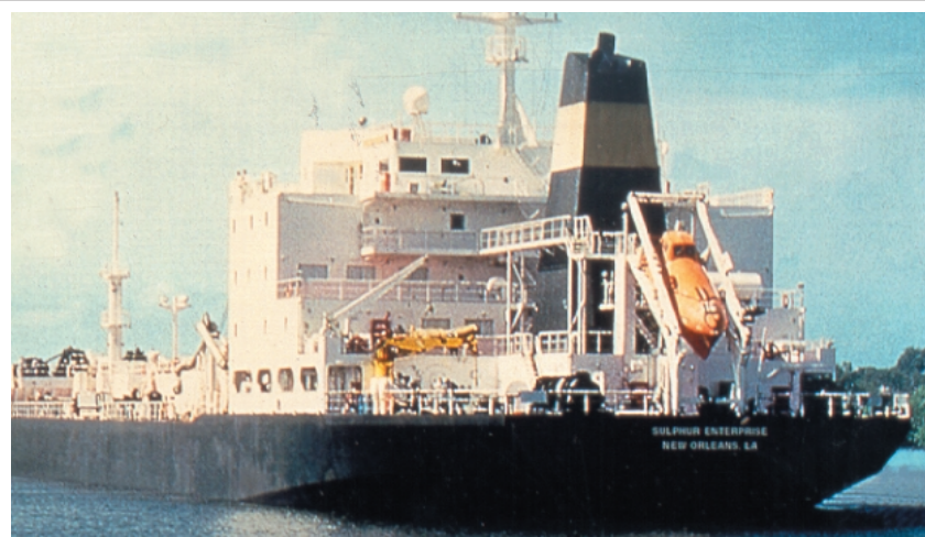
TOP: The M/V Sulphur Enterprise carries about 24,000 tons of molten sulphur from Louisiana and Texas to Florida. A sophisticated thermal maintenance system with bolt-on heating elements from Controls Southeast Inc. keeps the molten cargo flowing for loading and discharge.

Sulphur remains liquid at temperatures from 240 to 310F, but quickly increases in viscosity above 320F and freezes at 240F. The bolt-on thermal maintenance system of Sulphur Enterprise is designed to maintain its cargo at 278F throughout load-